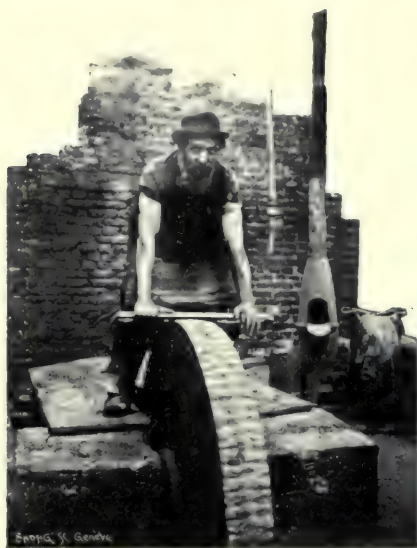
Fig. 11. A POLISHER AT WORK.

member ( associé ) of the society, received £8 12s. at the division of profits for the year 1898-9. This went to increase his "Savings' Certificate," that is, his